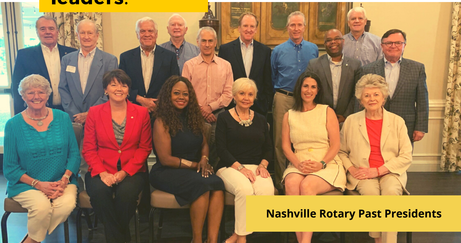
Nashville Rotary Past Presidents